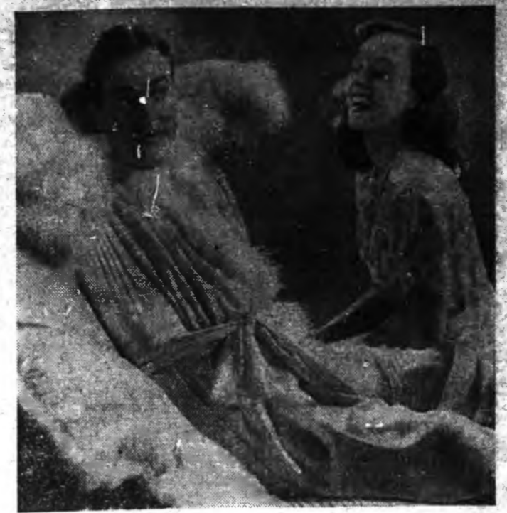
THAT'S NO LADY—That's Bob Hope, just trying on a snappy little frilly number (heh, heh) for size, and getting the ha-ha from Paulette Goddard. That is just a sample of the things that go on (and off) in "Nothing But The Truth," new Paramount comedy opening Thursday and Friday at the Liberty Theatre.