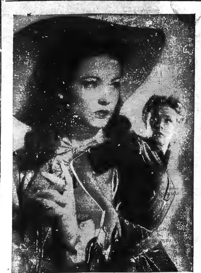
The amazing transformation of "Belle Starr" from a sheltered Southern beauty to a fearless bandit queen with a price on her head is graphically depicted