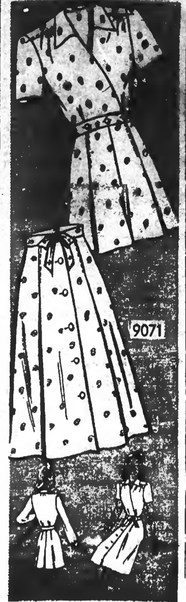
Pattern 9071 may be ordered only in misses' and women's sizes 12, 14, 16, 18, 20, 22, 24, 26, 28 and 30. Size 16, entire ensemble, requires 5 yards 35-inch fabric.

Send SIXTEEN CENTS in coins for this Marian Martin pattern. Write plainly SIZE, NAME, ADDRESS, STYLE NUMBER.