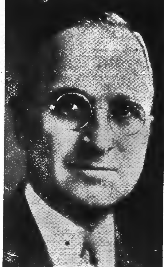
HARRY S. TRUMAN