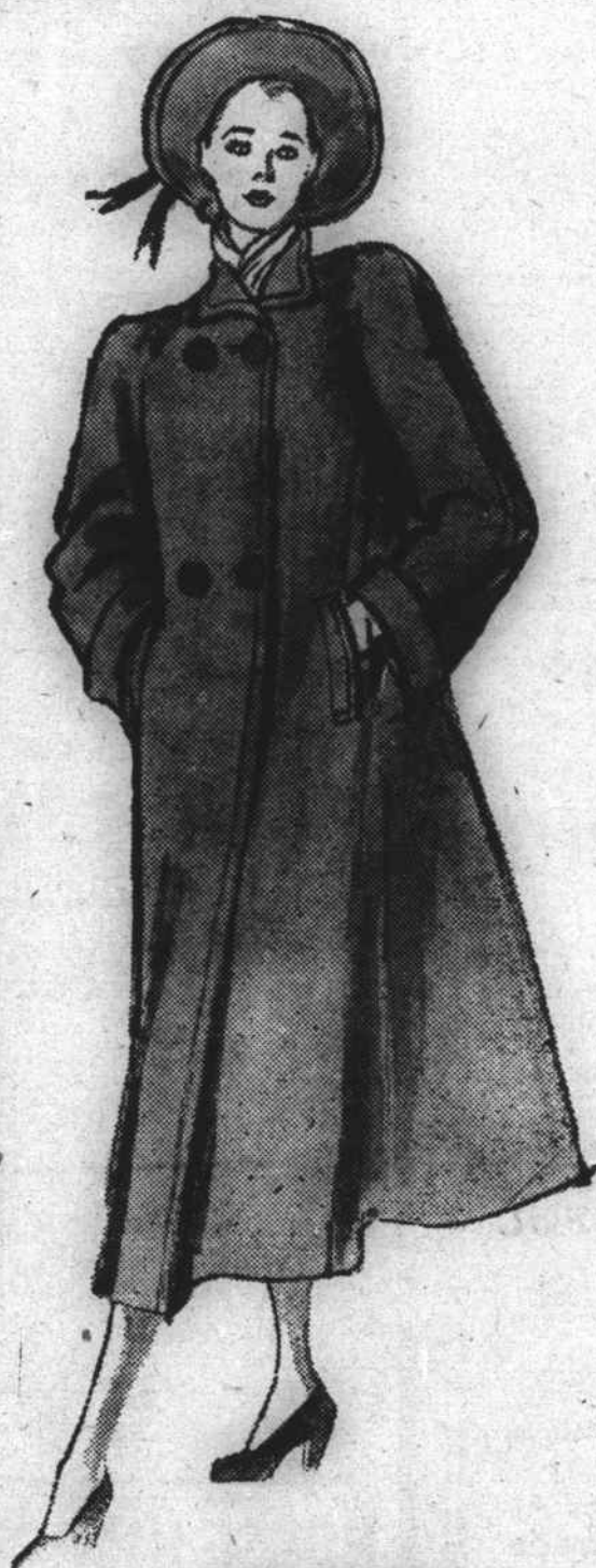
COATS $24.95 up