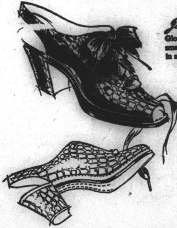
Java Glove-fitting oxford th. smart-as-can-be in alligator calf.