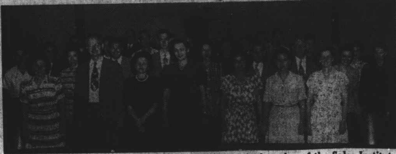
Here is pictured part of the number attending final session of the Sales Institute conducted under the auspices of the Trade Promotion Committee of the Wilkes Chamber of Commerce, when certificates were presented the large number who attended the sessions.