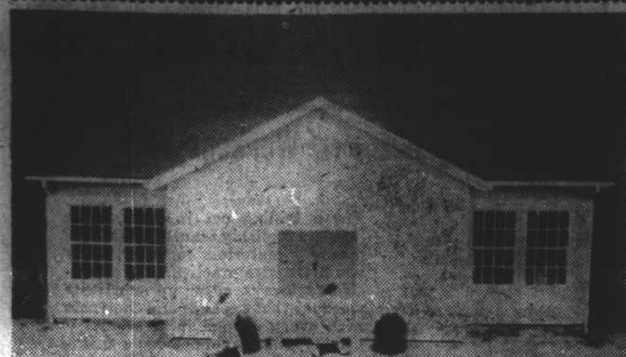
One of the principal projects of the Pores Knob club was the erection of the community house shown here.