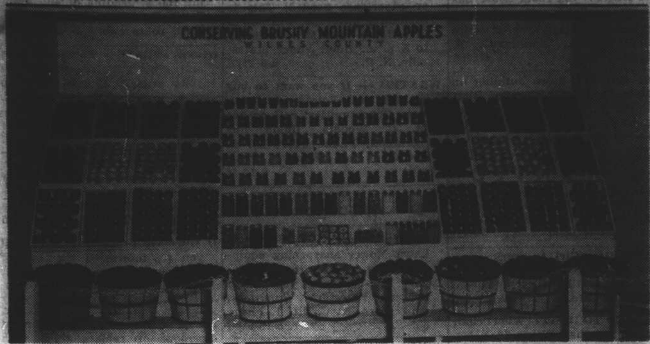
One of the most interesting exhibits in the history of the North Carolina State Fair was put on this year by the Home Demonstration club women of Wilkes County showing numerous ways to can apples. The exhibit was given wide publicity and attracted the attention of many high officials and agricultural authorities.