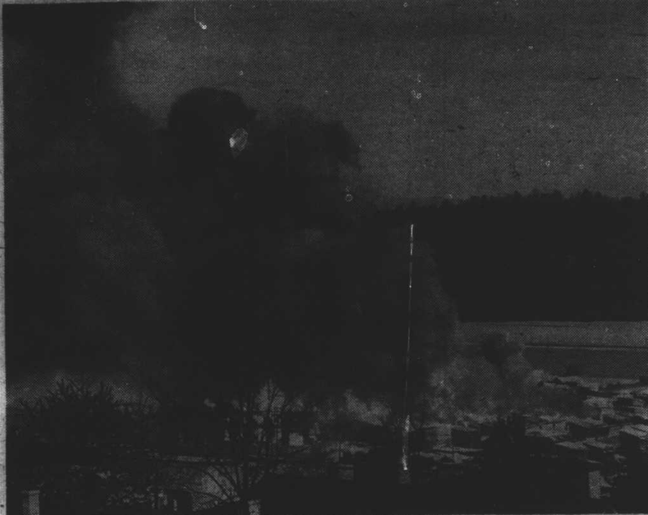
Taken about six p. m., April 29, this scene shows smoldering ruins when the Brown lumber plant and yard were located. In the background are ruins of the ice and fuel plant.

children need? How can the home life of America's children be strengthened? These questions are important to each of us. They are important to every community and to the entire Nation. Today's