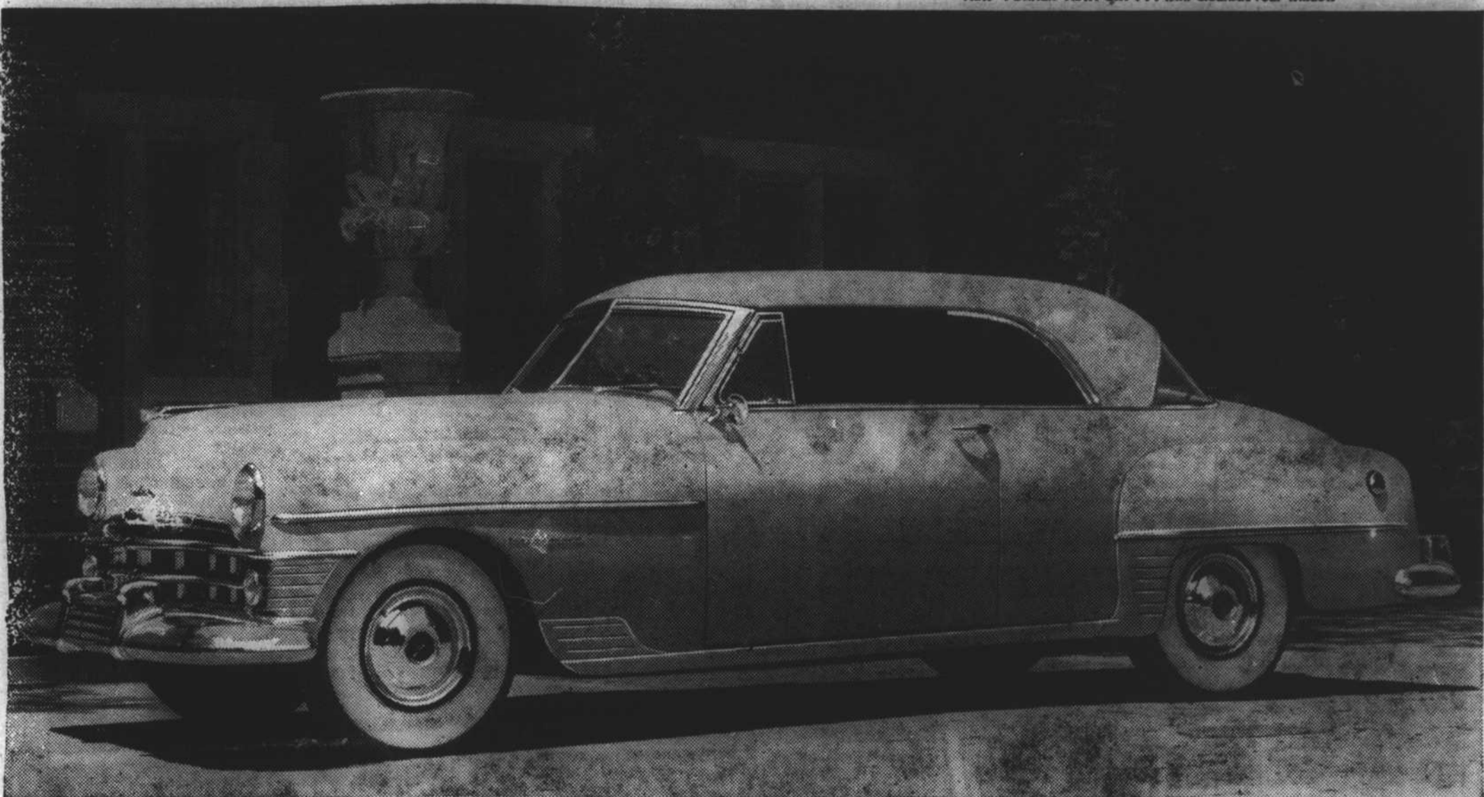
NEW YORKER NEWPORT... with Clearbac rear window

See it—drive it... there's built-in value all the way through!