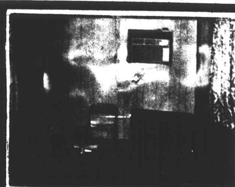
Relax in a modern Lounge area while waiting for your order.