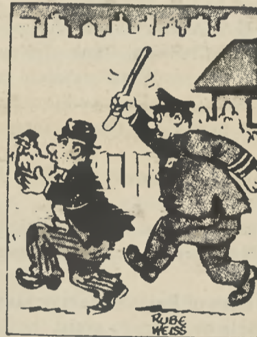
Call a man a thief, and you license him to steal.