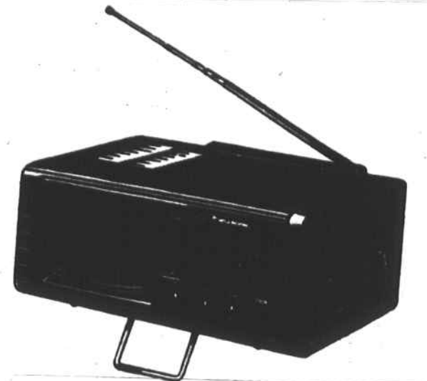
Panasonic TR-525 $139.95

5" Diagonal AC/Battery 100% Solid-State Portable features 3-Way Operation including house current, dry cell batteries and car battery with optional adapter (model TY-192P). Olive green cabinet. With earphone and Panasonic alkaline batteries.