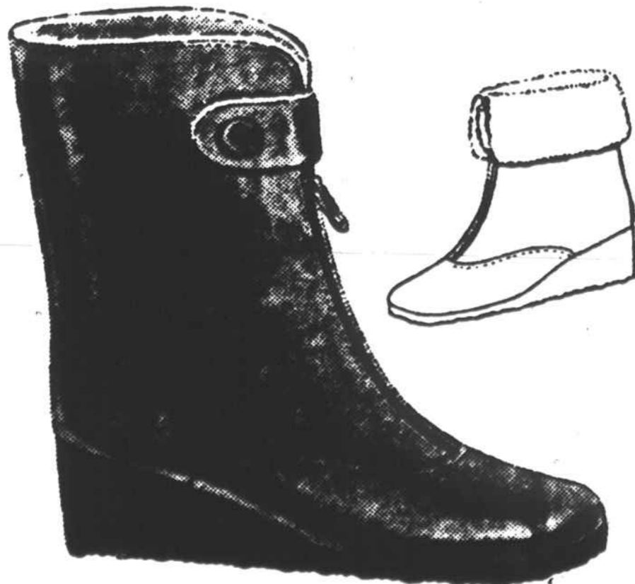
Black Leather Brown Leather $31

4 Locations! One Near You: DOWNTOWN • REYNOLDA • PARKWAY • NORTHSIDE