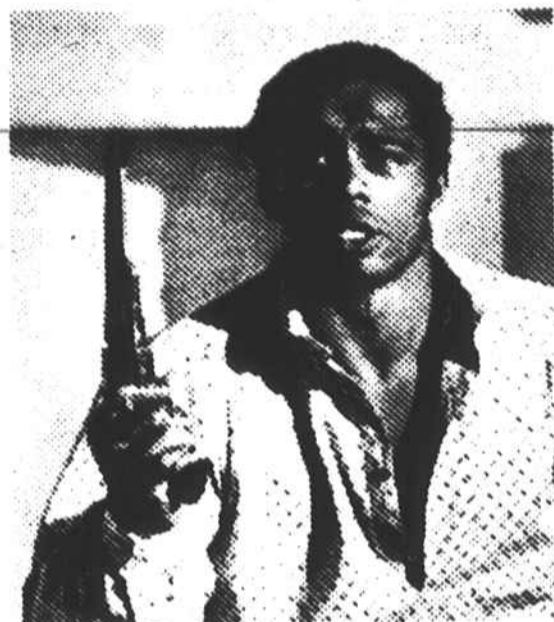
Still DR-10 Mat 1A An enraged Ken Norton raises his pistol in preparation to storming a plantation manor and burning it. Norton has the title role in "Drum," a United Artists release opening Now at the Parkview Theatre.

To Norton, fighting professionally and acting are similar because both are demanding pursuits, especially if you wish to succeed in them. Both require much preparation, research, and then in the actual performance are strenuous, pushing one to the limit, Norton knows.