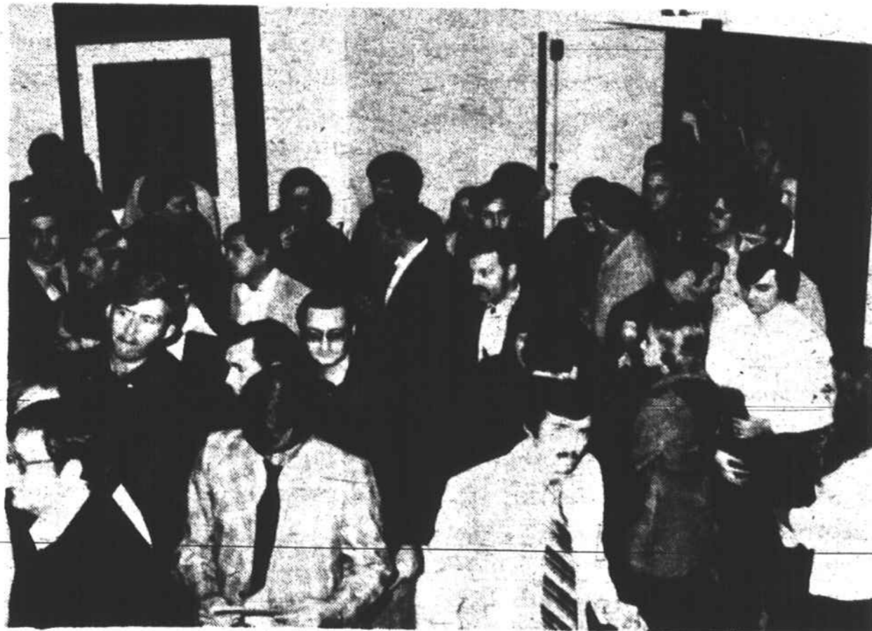
More than 200 people, interested citizens, reporters and police officers, crowded into chambers to hear case of police grievance procedures.

He said, "The gains that were made when blacks took to the streets to bring about changes hav almost come to a halt in many instances." He