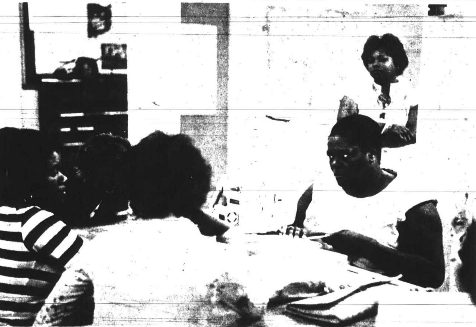
Teaching the Teachers: these ESR workers are learning the fine points of making slipcovers, so that they can pass along this skill to senior citizens in Project Make It Better.