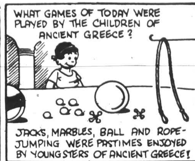
JACKS, MARBLES, BALL AND ROPE-JUMPING WERE PASTIMES ENJOYED BY YOUNGSTERS OF ANCIENT GREECE!