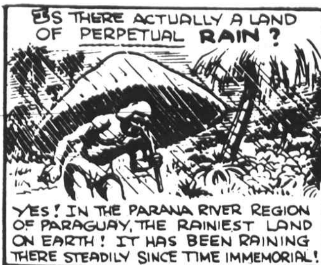
YES! IN THE PARANA RIVER REGION OF PARAGUAY, THE RAINIEST LAND ON EARTH! IT HAS BEEN RAINING THERE STEADILY SINCE TIME IMMEMORIAL!

The eclipses in a pair can occur in either order. This autumn, the lunar eclipse precedes the solar by two weeks. Last October and November the reverse was true.