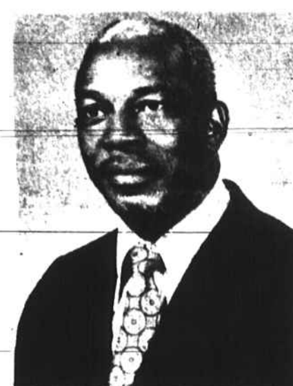
LeRoy T. Walker for Achievement in Sports