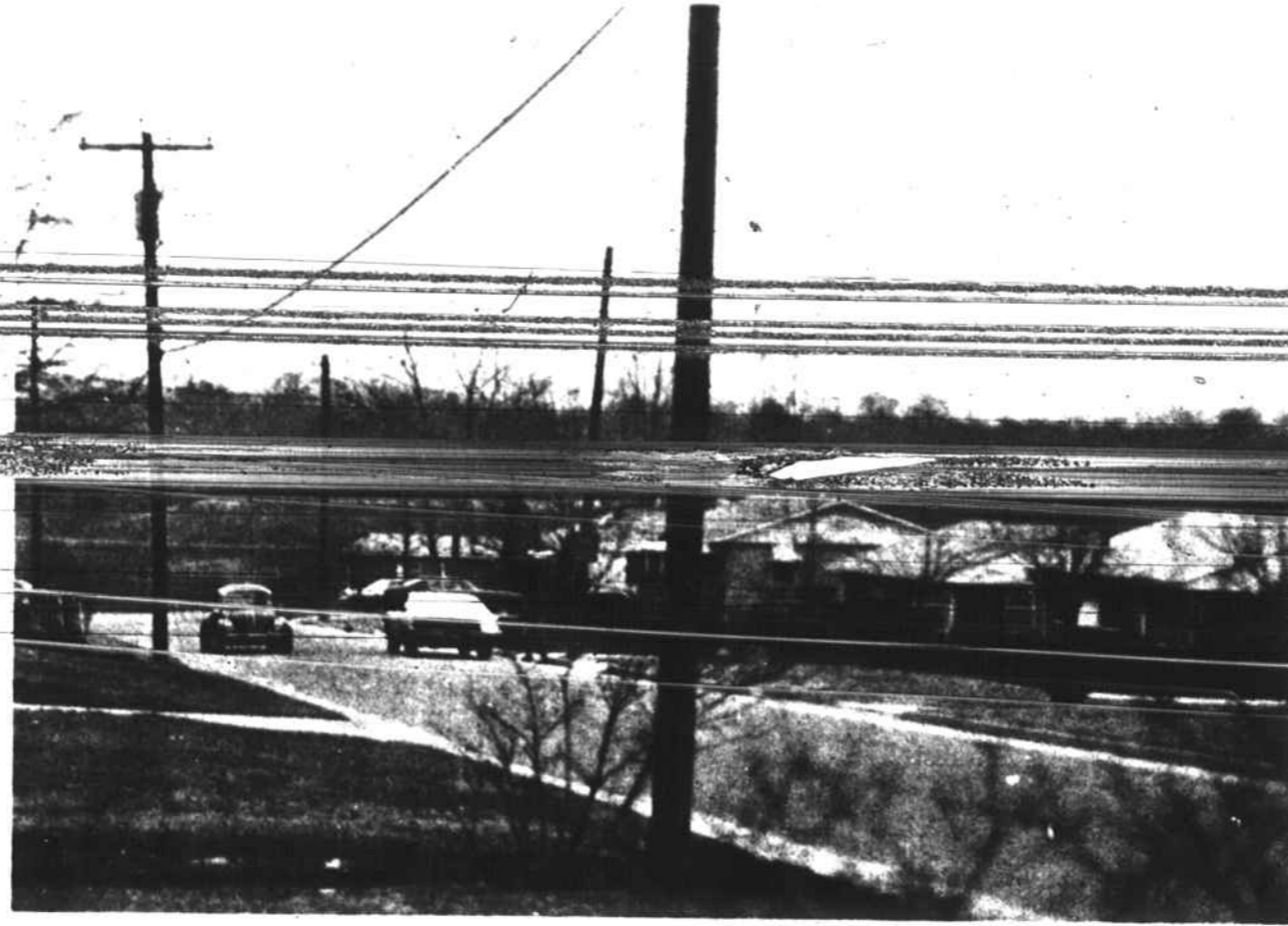
A view of the Castle Heights Community on Teresa Avenue, one of the main streets in the community.

moved in and caused trouble have moved out," Belton said.