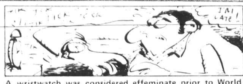
War I, but this bias was overcome when the timepiece showed it practicality.