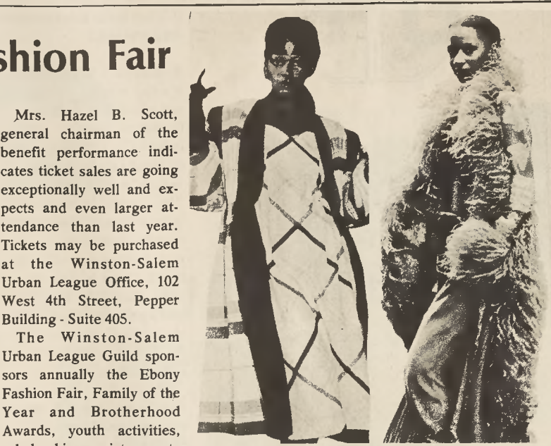
Fashion Fair Models