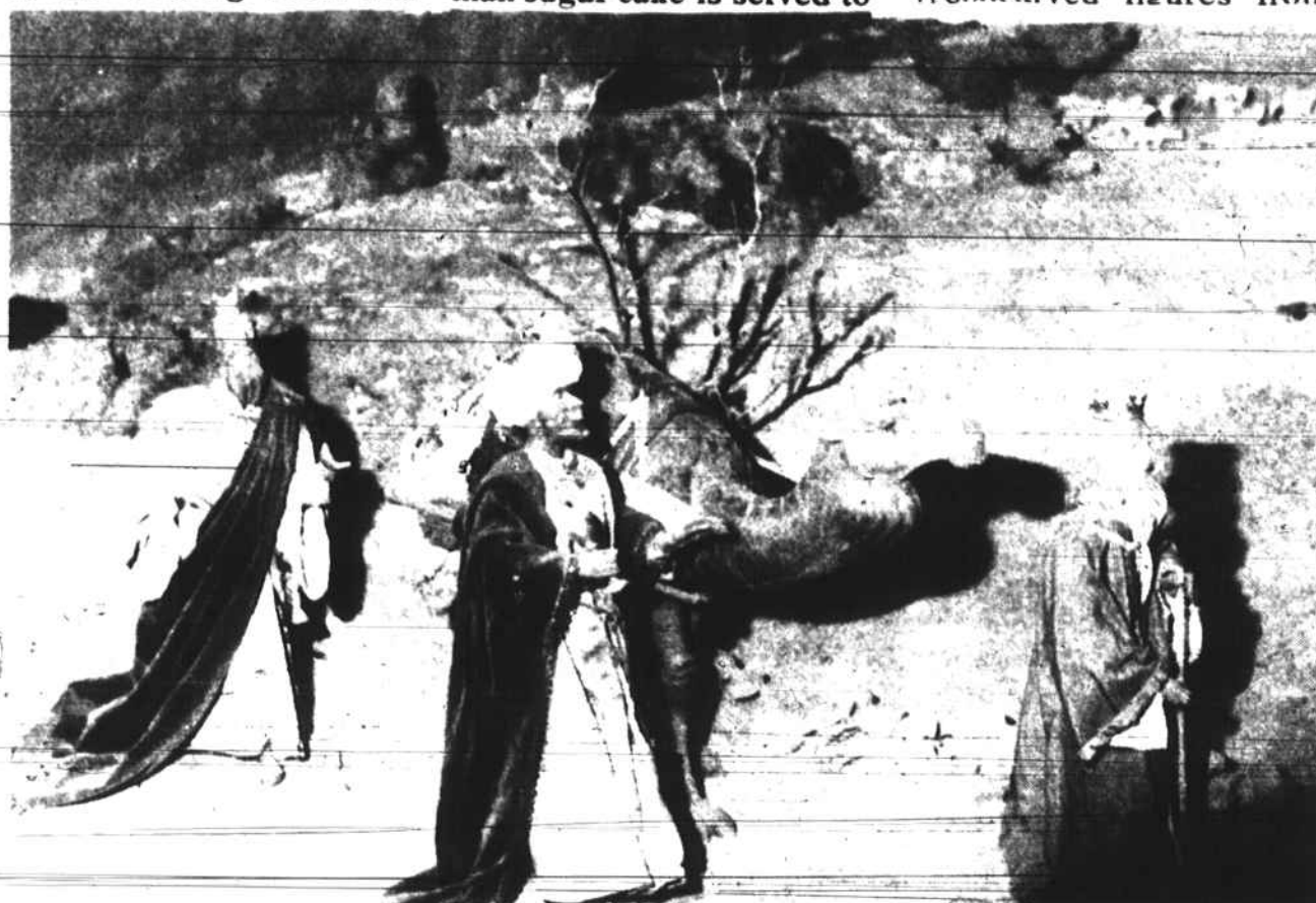
The "putz", or Christmas decorations feature a nativity scene of hand carved figures from Germany.