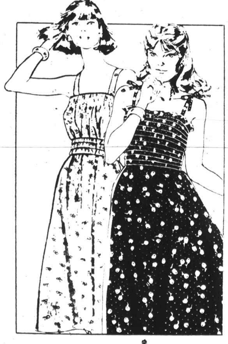
SALE STARTS THURSDAY, MAY 13

MORE UNBELIEVABLE VALUES AT SEARS SURPLUS STORE!