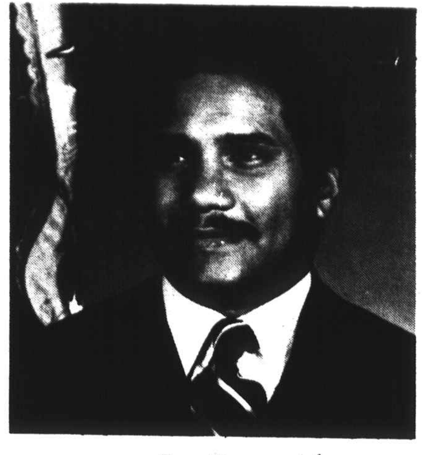
Togo West -

West, a native of Winston-Salem, was general counsel of the Department of Defense from 1980 to 1981. He to 1976.