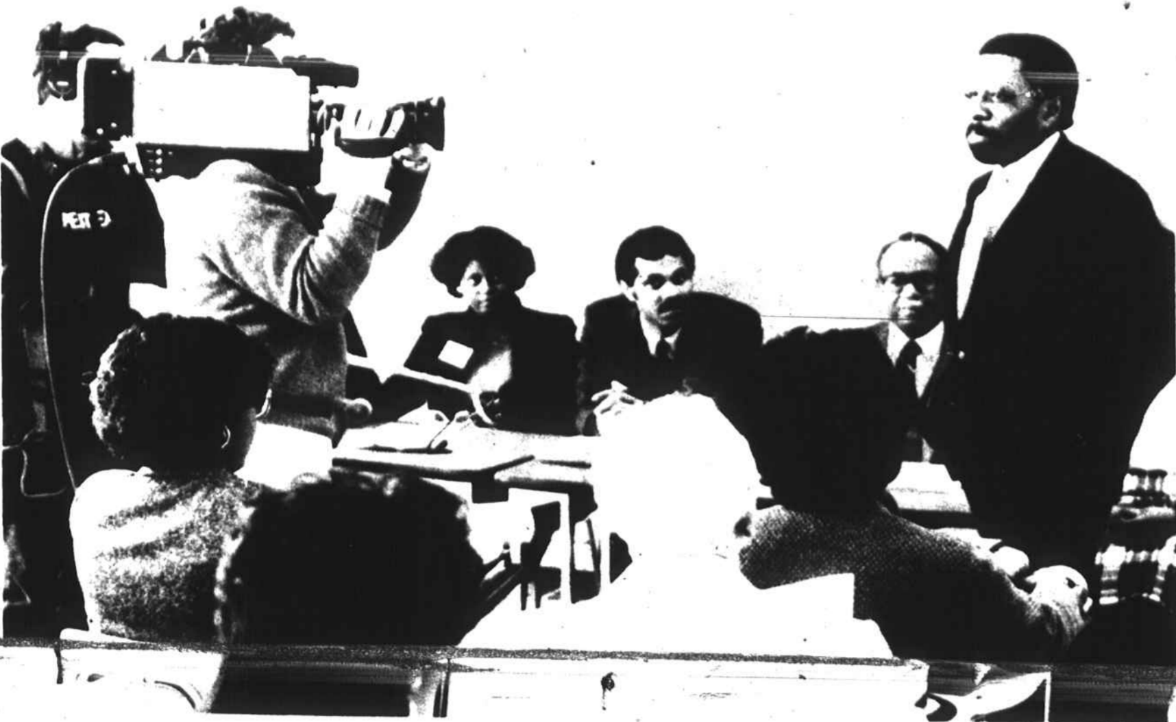
Keynote speaker at the annual Mass Media Careers Day Conference at A&T State University was Robert Maynard, standing. Maynard, who operates the Oakland (Calif.) Tribune, is the first black publisher of a major daily paper in the United States.