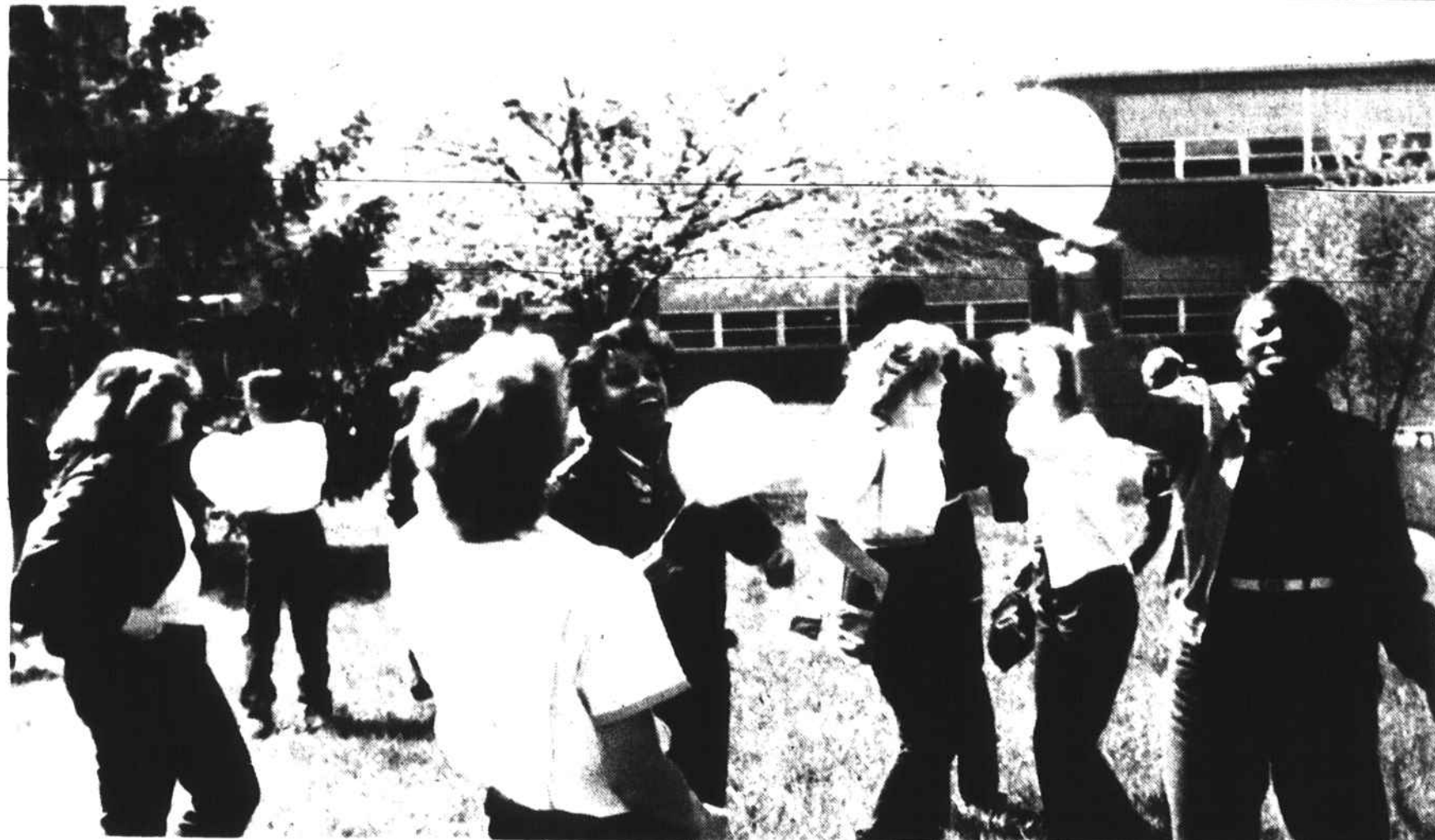
Students at Glenn Junior High School participate in the balloon launching in observance of the school's Library Media Day.

For sweethearts and wives of the fraternity members, a special moment will be dedicated only to them. That special moment, say members, will culminate with the singing of their sweetheart song.