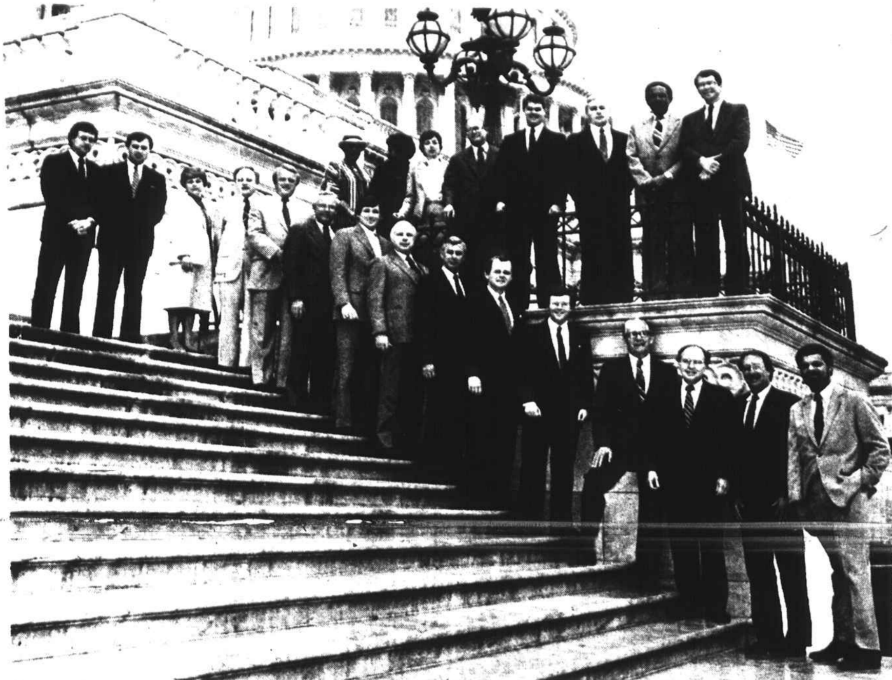
Business and civic leaders from the Greater Winston-Salem Chamber of Commerce met with Rep. Steve Neal, D-N.C., during their recent trip to Washington.