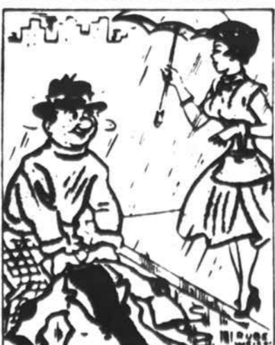
Politeness is the science of getting down on your knees before folks without getting your pants dirty.