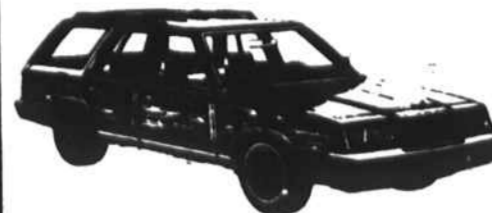
Chrysler Town & Country Wagon