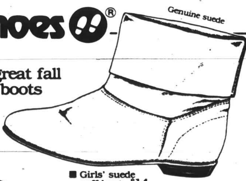
■ Girls' suede cuff boot...$14