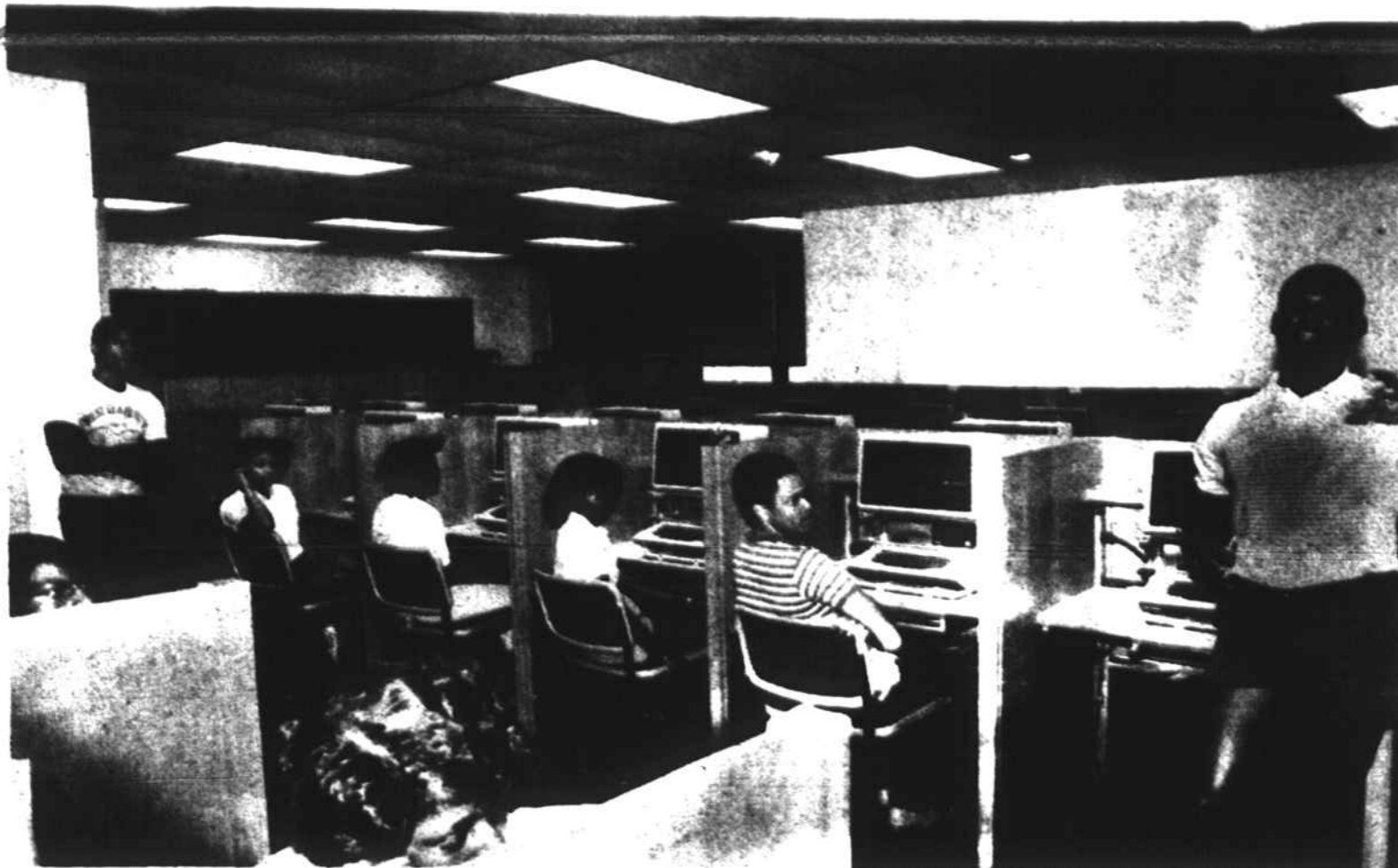
Participants in the East Winston Noon Optimist Club Computer Workshop listen as one of the instructors lectures them on computer programming.

The 3,500-member 108th Division, headquartered in Charlotte, has units located throughout North and South Carolina. The division is one of the largest Army Reserve components in the two Carolinas.