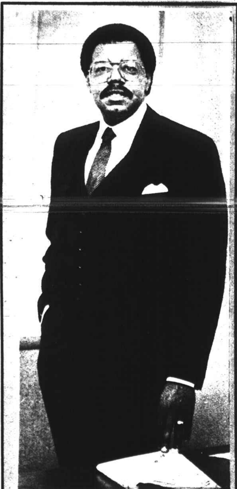
Tidwell: "I prefer conservative clothing. I especially like two-button, single-breasted, three-piece suits because it's so easy to dress them up or down."