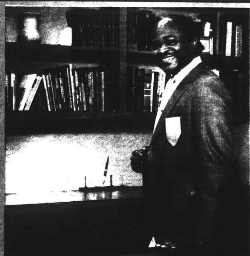
Kennedy: "To me, dressing is a physical expression of my emotional state and to dress elegantly improves my disposition."