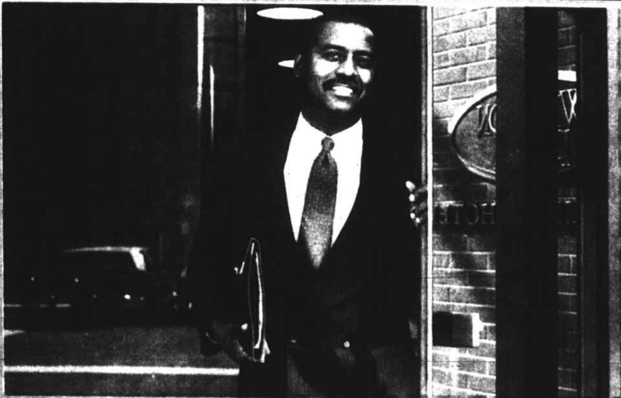
Redd: "I love wearing suits. I try to buy suits which are fashionable as well as flattering to me and my personality."