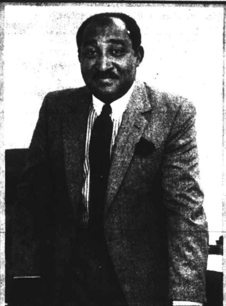
Couch: "I like the tailored fit of the European suits because they give the businessman that 'dressed for success' look. The glove-like fit of the Italian shoes is a perfect compliment to the European-cut suit."