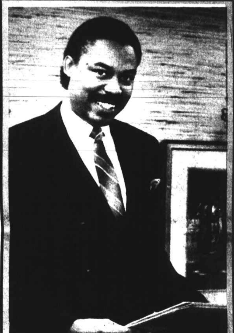
Russell: "I prefer the more detailed custom European cuts. Accessories are chosen to maintain comfort and style throughout the day and at the same time reflect casual elegance into late evening engagements."