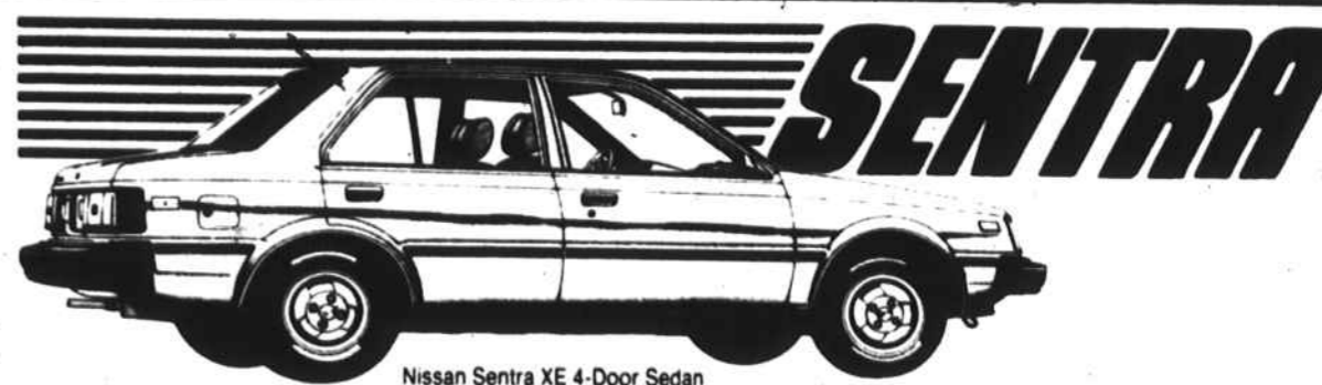
Nissan Sentra XE 4-Door Sedan with optional Alloy Wheels