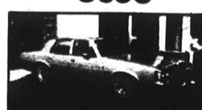
'84 OLDS CUTLASS $6995