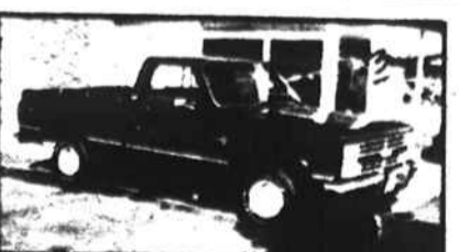
'85 CHEVY SILVERADO $11,495