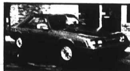
'85 FORD MUSTANG GT $10,900