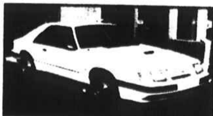
'86 FORD MUSTANG S.V.O. $14,995