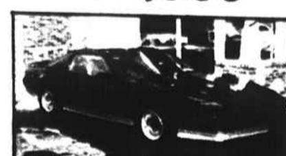
'84 PONTIAC TRANS AM $9595