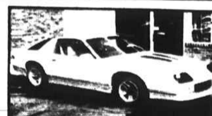
'85 CHEVY Z-28 $10,900