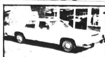
'83 FORD CROWN VICTORIA $8995