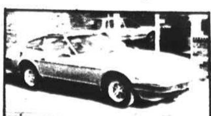
'83 DATSUN 280 ZX $8395