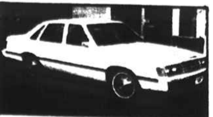
'85 FORD LTD $7995