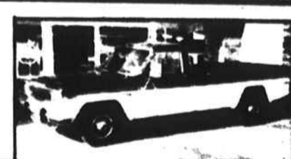
'84 AMC JEEP 4x4 $8695