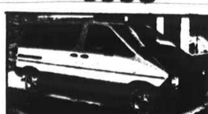
'86 AEROSTAR XLT $14,500