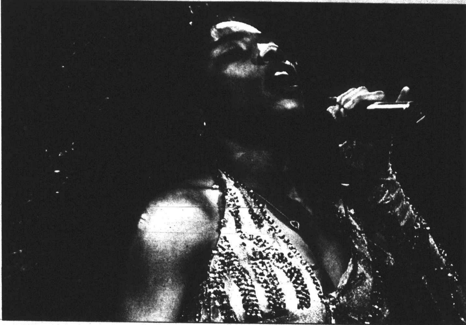
Singer, songwriter and performer Karyn White gives her all to an enthusiastic audience during her performance at last weekend's Superfest in Greensboro.

DO YOU HAVE AN ENTERTAINMENT EVENT YOU'D LIKE TO SEE IN OUR CALENDAR? BRING THE INFORMATION TO THE CHRONICLE BY 5:30 P.M. ON MONDAY FOR THAT THURSDAY'S EDITION.