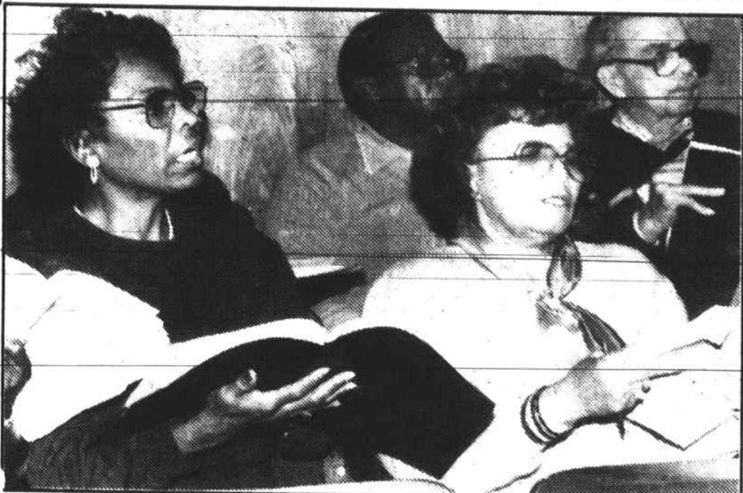
The choir of First Baptist Church, some members of which are pictured above, will present the oratorio "Messiah" on Dec. 10.

Local church and choir members are invited to participate in the church's program.