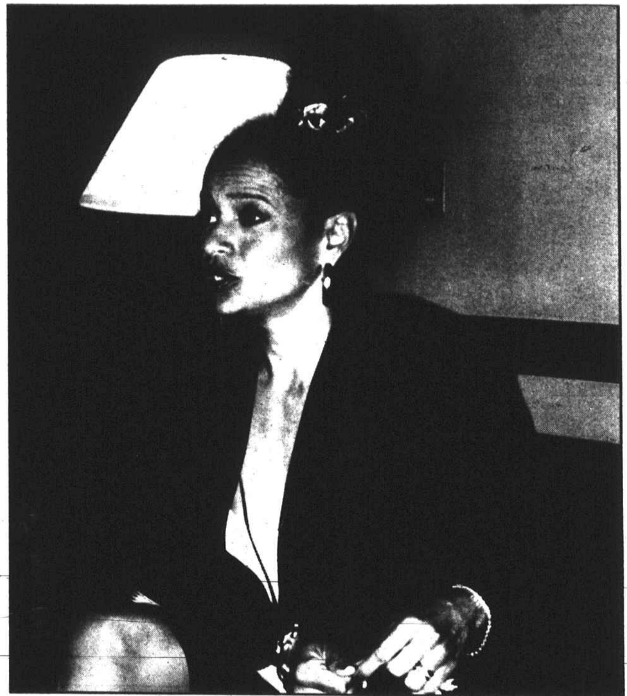
Debbie Allen is one of the top television directors and producers, as well as choreographers, in the industry.

Today, she is one of the most sought after talents in the television industry. "I have become the top director, producer, choreographer in television. I said the top