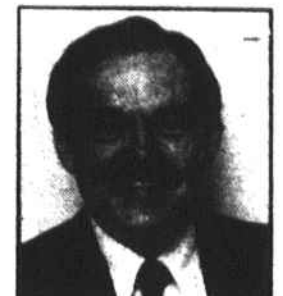
GENERAL SALES MANAGER