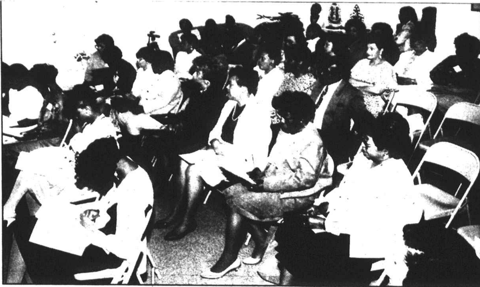
Pictured are parents, sorority members, and Fashionetta contestants at the Orientation meeting on May 31.

Although the presentation of the Fashionetta pageant is the high-