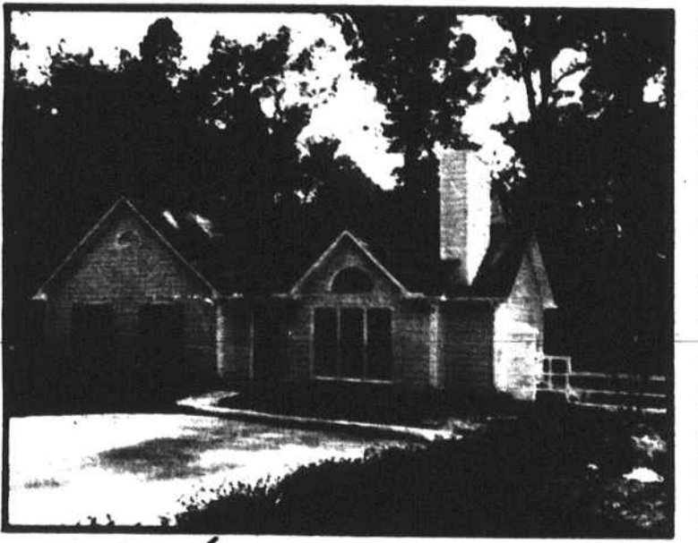
20 13 homes already sold!

The Triad's showcase of affordable luxury homes, priced from $85,000.