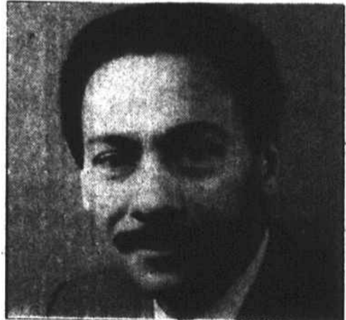
The Honorable Mel Watt, Congressman, 12th District