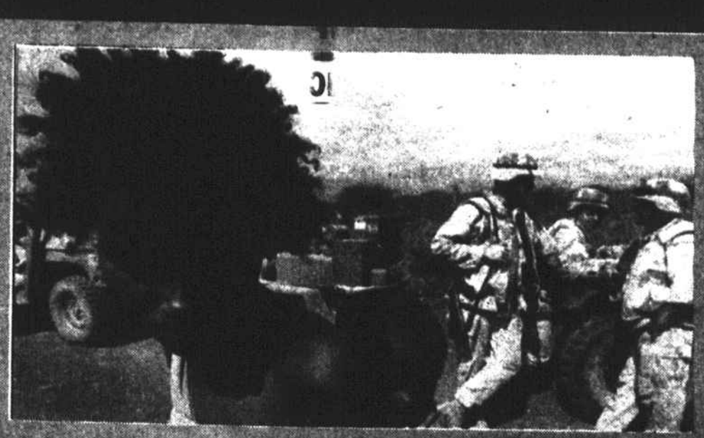
I woman and child shy away from U.S. Merines by te between Baidoa and Bardera