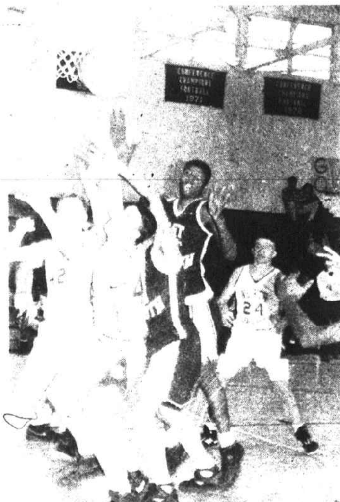
North and East Forsyth JV players scramble for control of the rebound.