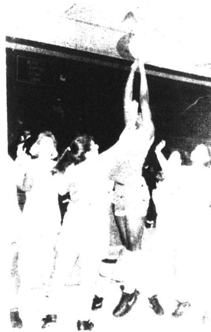
A JV Lady Jacket tries to block a 2-point basket.