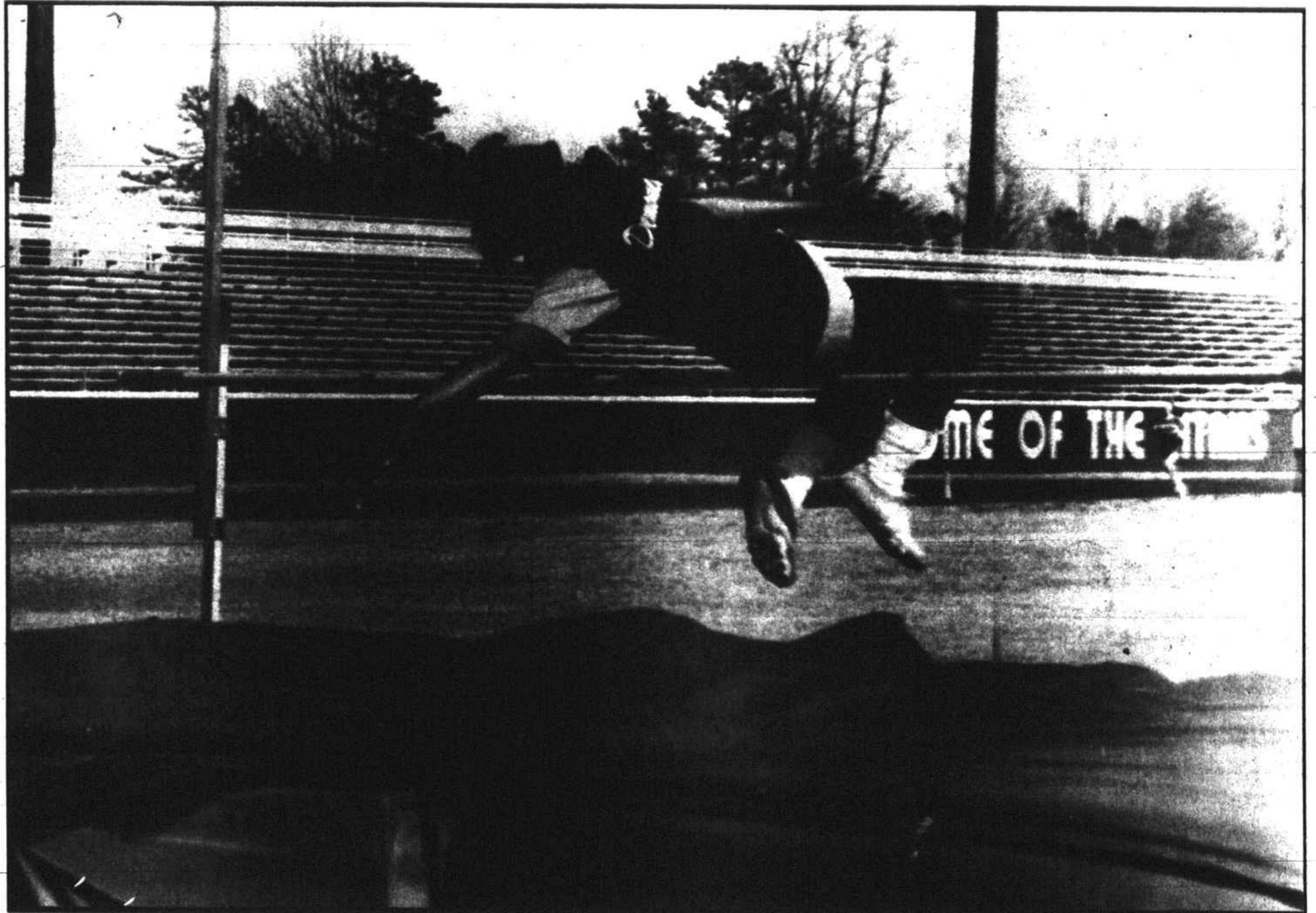
Tough competition and strong endurance could be felt as this lady High Jumper cleared the pole.