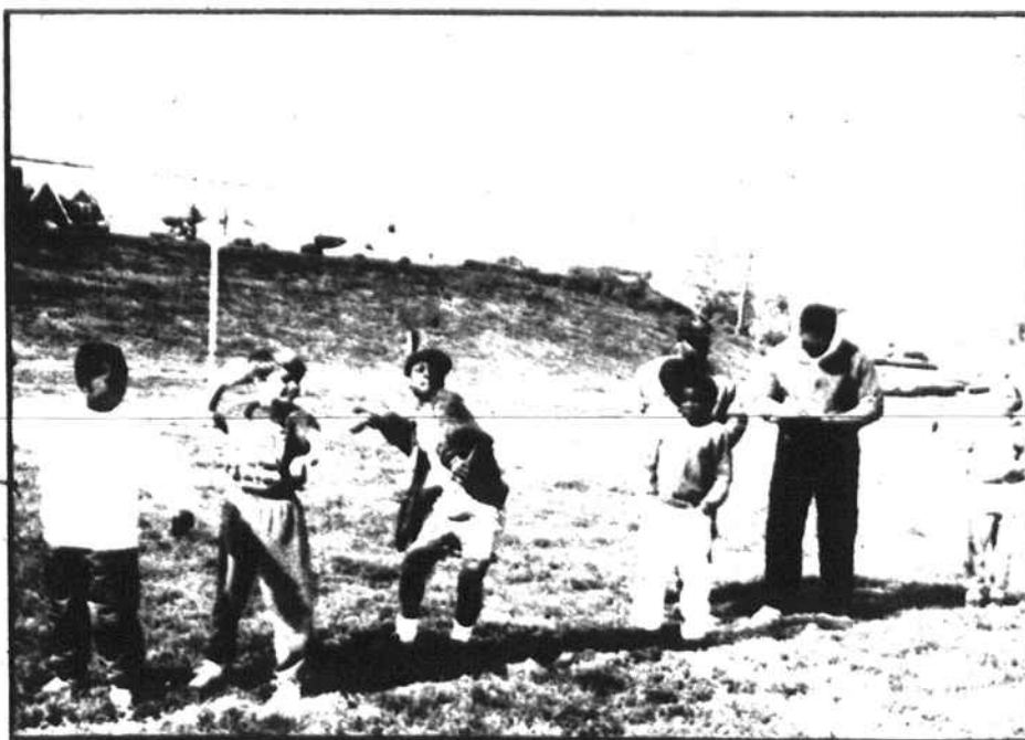
Participants are warming up for the softball throw contest.