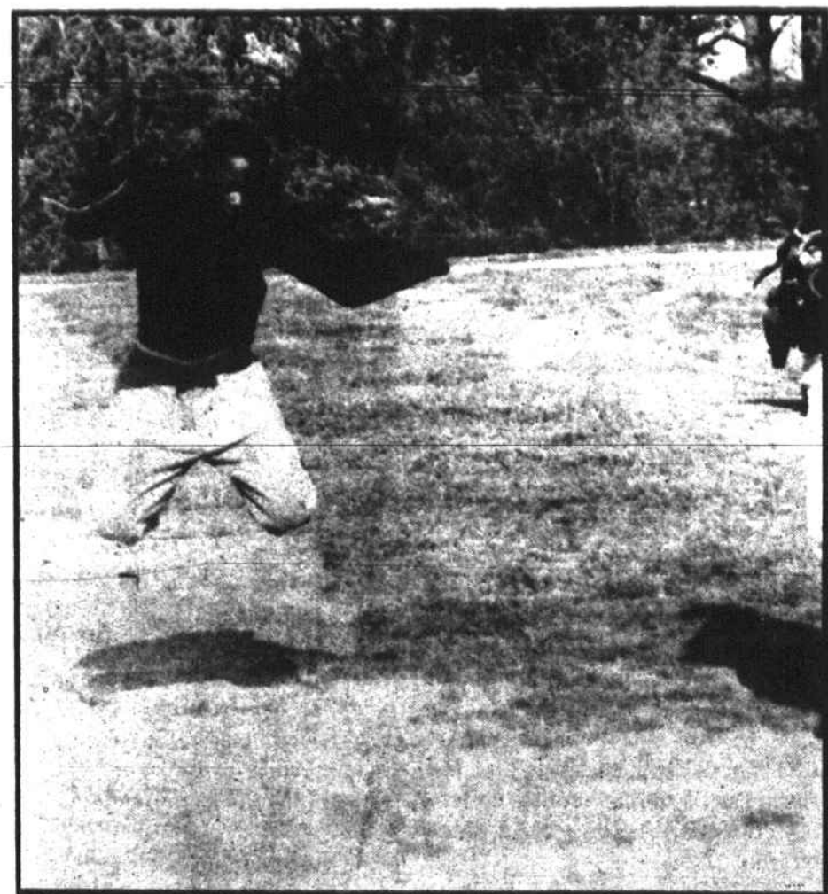
A high leap in the standing jump will accumulate added points for this participants.