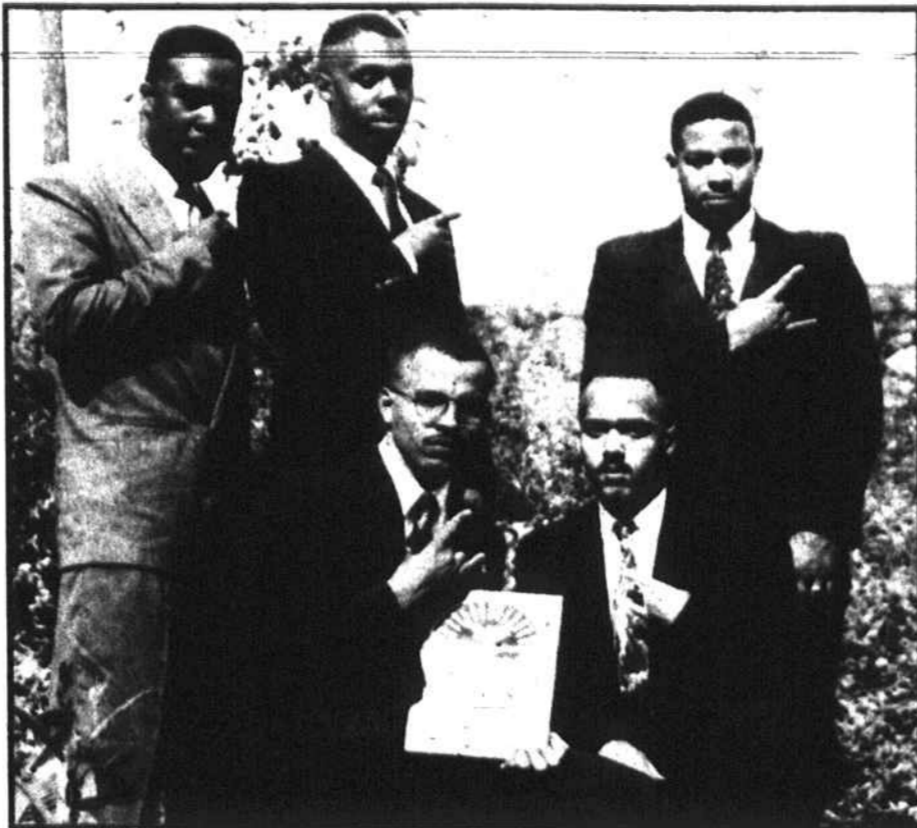
Pictured are the brothers from the Phi Beta Sigma Fraternity.