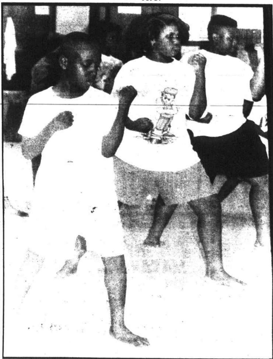
Students are concentrating as they take left fighting stance position.