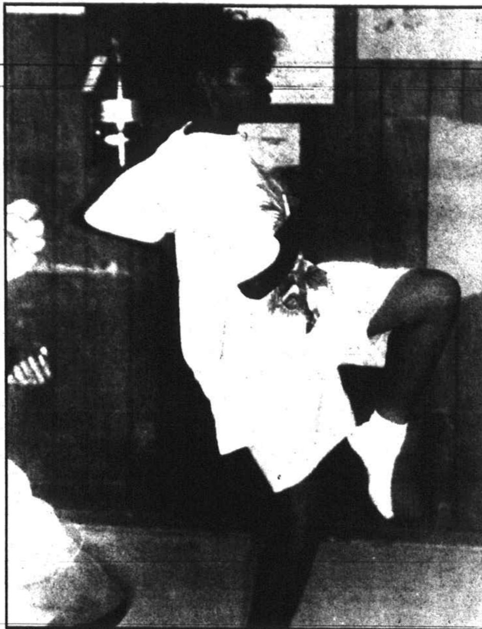
Kingston Green Karate Student shows form and balance, a must in training.