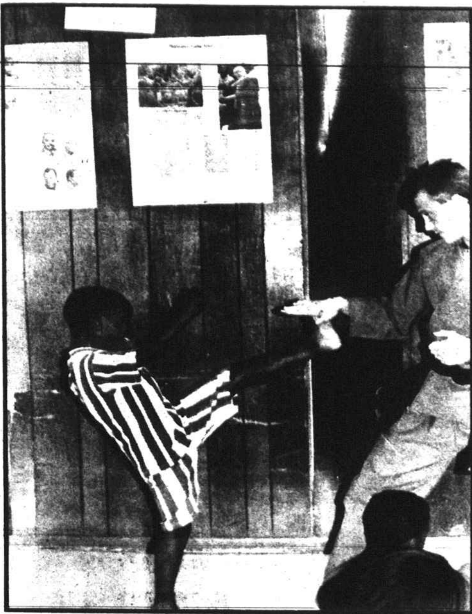
Kingston Green Karate Student demonstrates power of front snap kick with sensei.