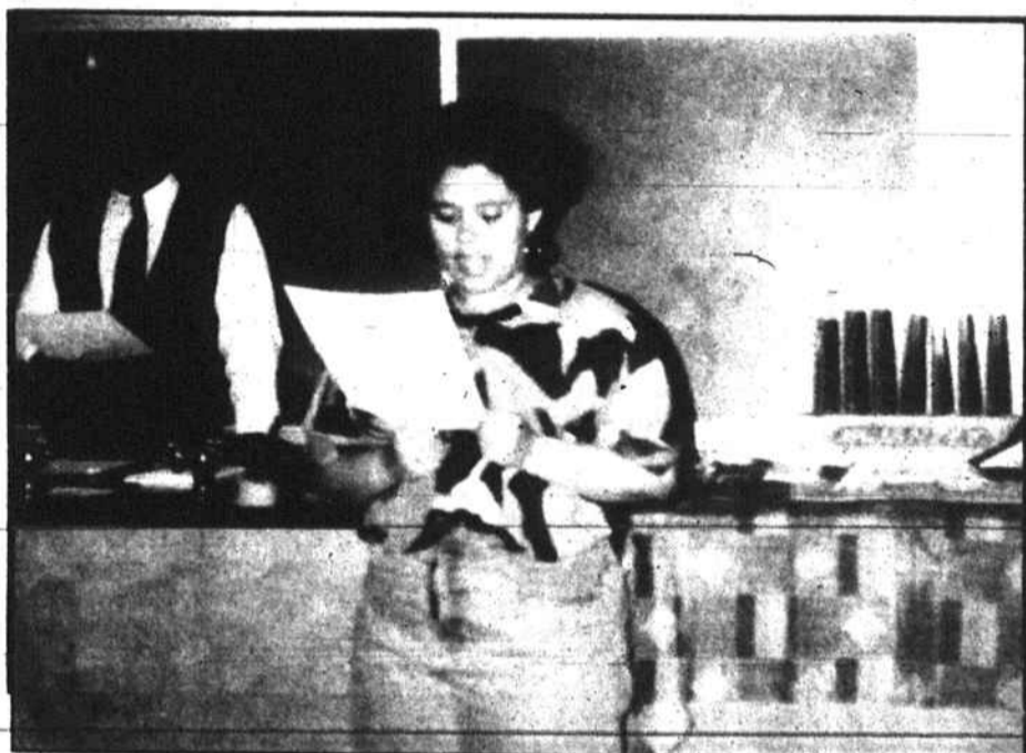
Youth of the local Jack and Jill chapter participate in a workshop.