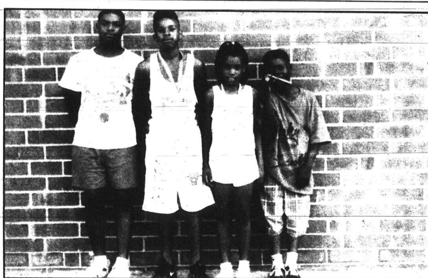
The Tri-City Relay Track Club brought home 55 medals from the AAU regional track meet last weekend. The meet was held in Raleigh.