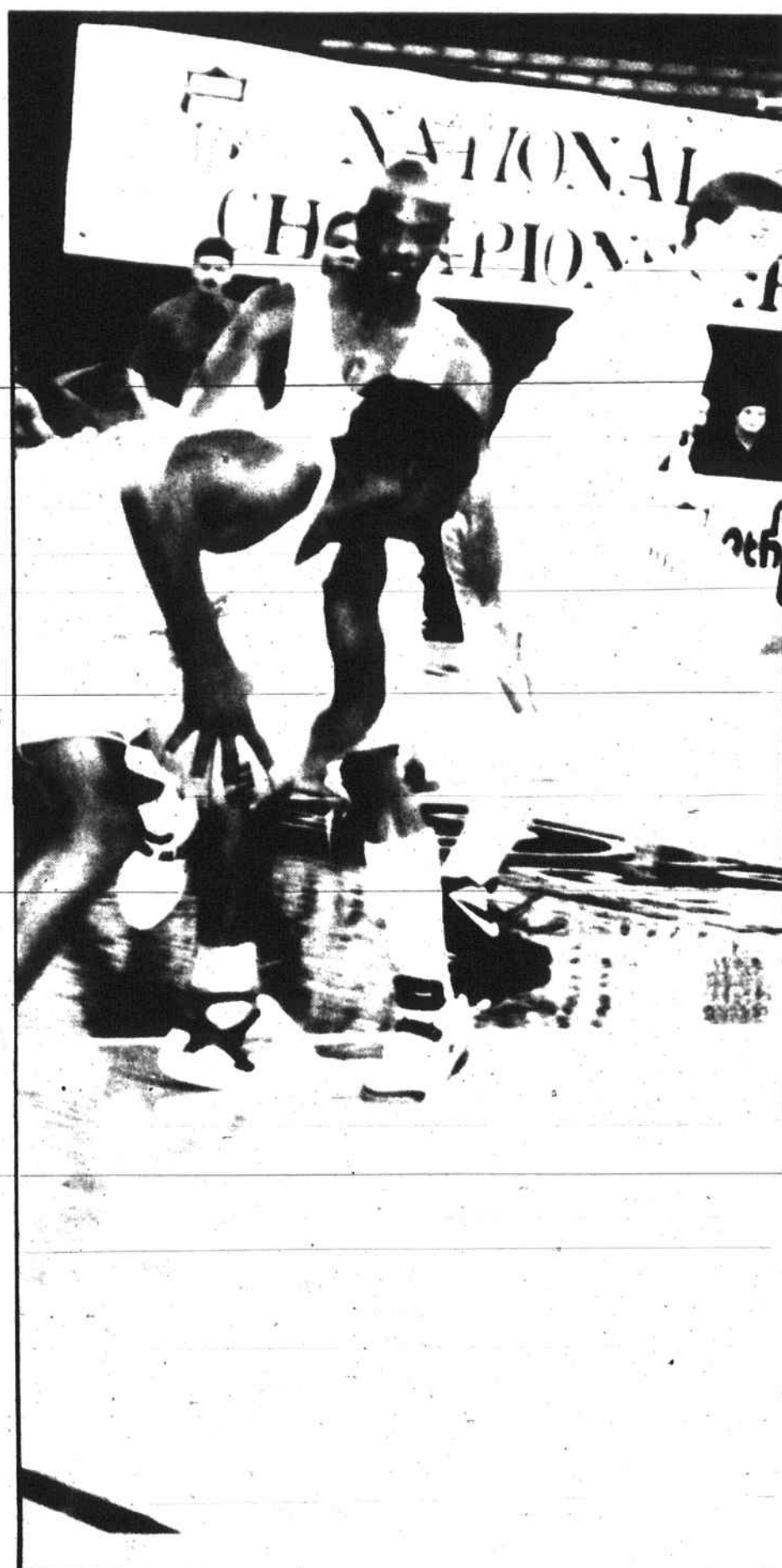
The Winston Lake Lakers were disillusioned in the opening game against Arkansas Wings Gold in the AAU junior boys national basketball tournament.